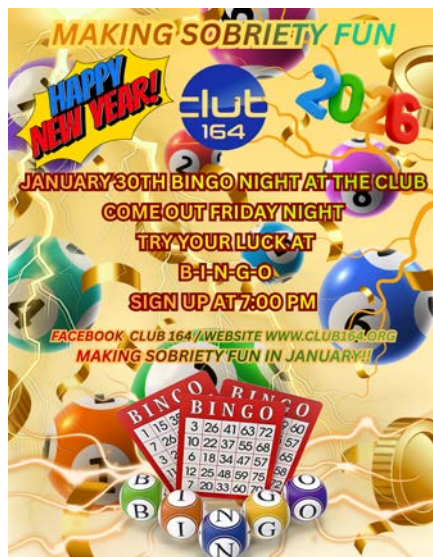
BINGO! January 30, 2026, 7 p.m.