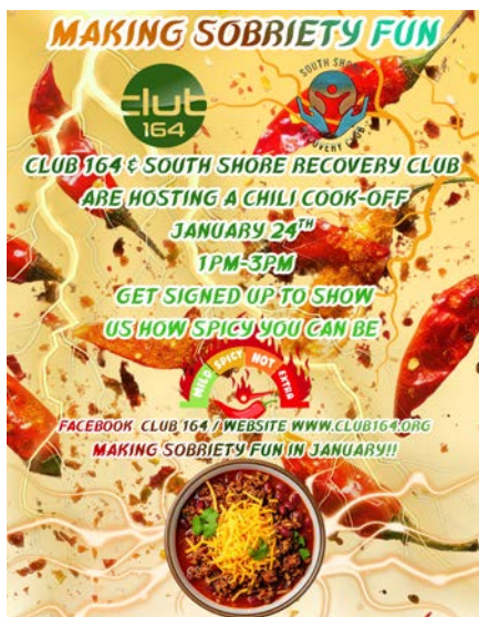
Chili Cook-Off January 24, 2026, 1-3 p.m. (see page 2 for more info)