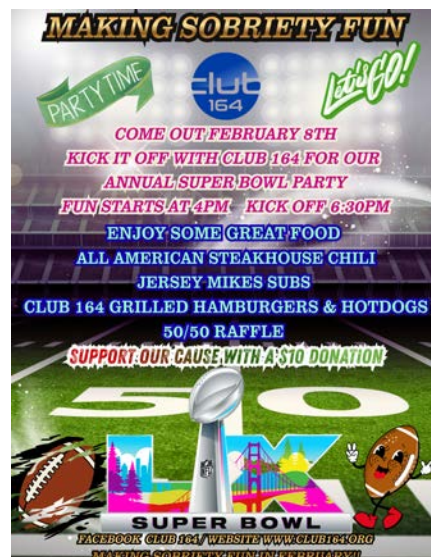
Super Bowl Party February 8, 2026, 4 p.m.